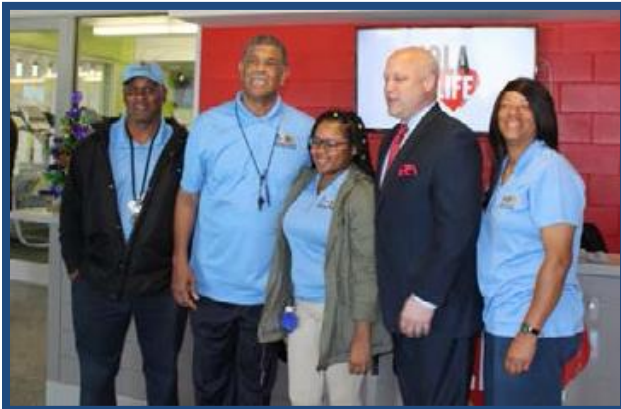
Ribbon Cutting Mile Rec Center