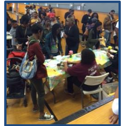
Summer Camp Expo Treme Rec Center