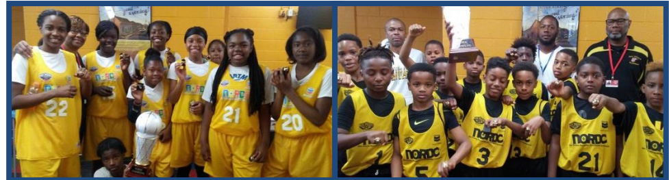
Basketball Championships Milne Rec Center