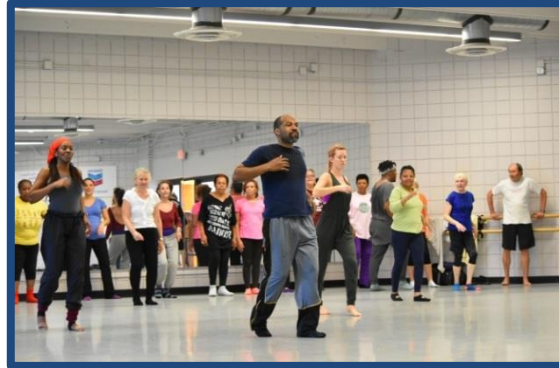
Dance Workshop Lyons Rec Center