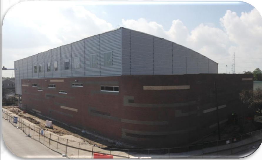
Rosenwald Gym & Grounds