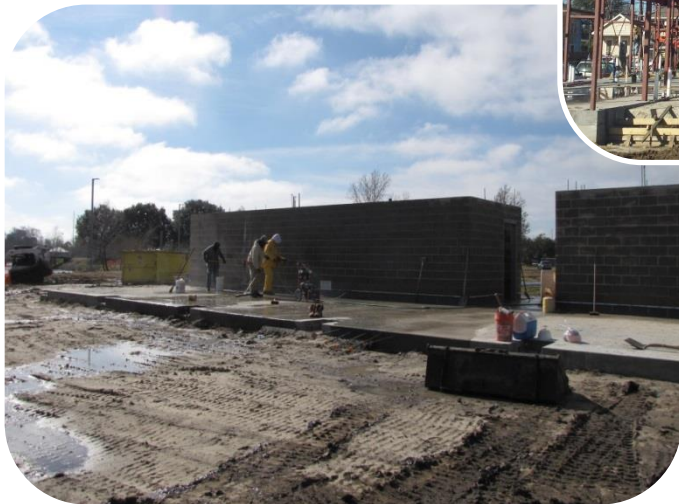
Joe Brown Park Westside Enhancements