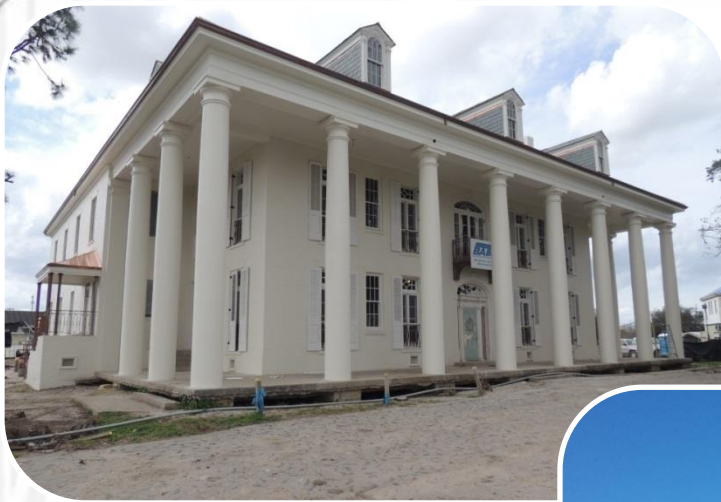
Milne Boys Home