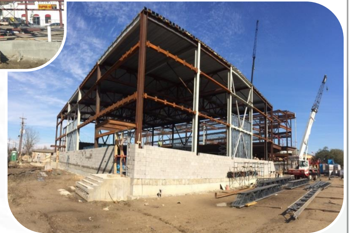
Sanchez (Copelin-Byrd) Center