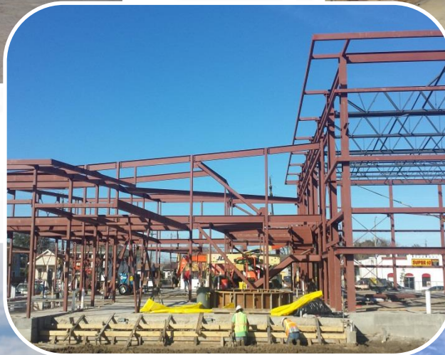
Stallings St. Claude Center