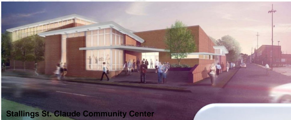
Stallings St. Claude Community Center